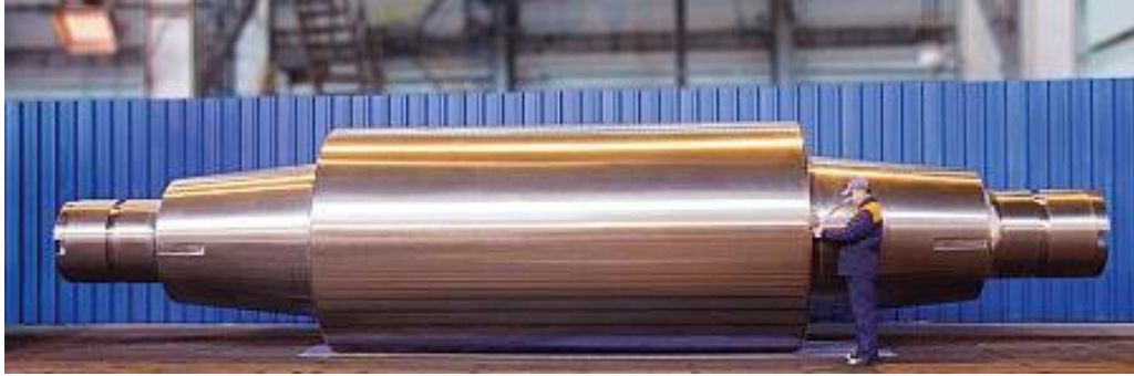
Figure 1. Large rolling shaft

Developed is the knowledge base on massive metal cutting equipment operation. Analysis of high-load CNC lathes operation showed that often technological saturation with these machines does not correspond to the structural and technological characteristics of the parts. The machine tools working space size sometimes significantly exceed the overall dimensions of parts, the number of shaping movements and tools in the store are also superfluous. This leads to an increased material and energy intensity of machine tools, and produced pieces' overpriced production cost.